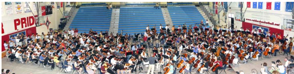
The Rising freshmen from Dodgen and Dickerson performing with the Walton High School Orchestra at the Dessert Concert April 16 th in the Walton Gym.