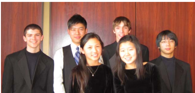
6 of our grades 9-10 Walton All State participants .

High school orchestra students from all across Georgia earn this honor by excelling during two rounds of auditions—district-level (October) and state (January). As members of Georgia's All-State Orchestra, these students travel to Savannah in March to work with nationally known conductors and play professional-level music. A concert on Saturday, March 6 highlighted the talent of these remarkable musicians from our Georgia high schools.